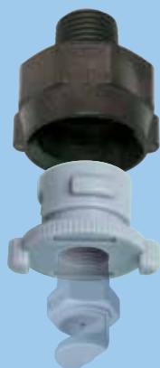
Photo is INCO with a wide-angle flat spray nozzle YYP series.